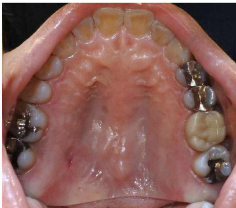
Fig. 3. Intraoral photograph (mirror image) showing a resolving ulcer at 1 week after the initial examination.