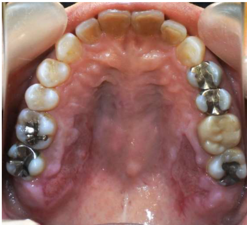
Fig. 1. Initial presentation of the ulcers on the bilateral palate mucosa in the molar region (mirror image).

Histopathological examination indicated a nonspecific ulcer without caseous necrosis; there were no signs of a tumor (Fig. 2). Immunohistochemical staining confirmed the absence of human immunodeficiency virus (HIV) type 1, cytomegalovirus, and Epstein–Barr virus. Periodic acid-Schiff staining indicated the absence of fungal infection. Laboratory tests were negative for white blood cells, C-reactive protein, desmograin 1 and 3 antigens, bullous