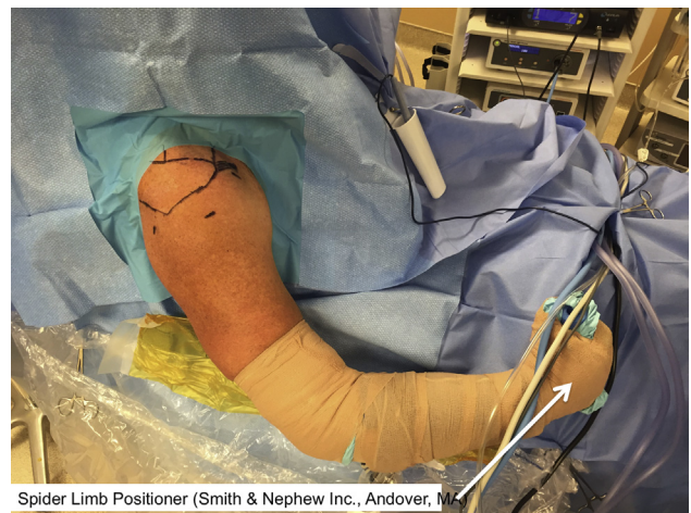
Fig 6. Intraoperative photograph demonstrating operative arm (right arm) of a patient placed in the beach chair position using the Spider Limb Positioner (Smith & Nephew).

After the patient has been transferred to the operating table and following the EUA, a team-based approach is used to ensure the patient is in the appropriate position prior to raising the back of the table up to the BC position. First, one should ensure that the patient is high enough on the table such that when the back of the table is raised, the patient's buttocks will be at the break