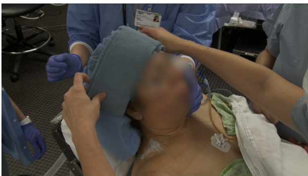
Fig 4. Intraoperative photograph demonstrating an alternative approach to securing the head and neck with a foam headrest and tape/towel construct.

Shoulder arthroscopy in the BC position is performed in the supine position, and can be conducted under general or regional anesthesia. When performing arthroscopic surgery in the BC position, we prefer the use of regional anesthesia with an interscalene block with sedation or with general anesthesia. If general anesthesia is used, the eyes can be protected with a