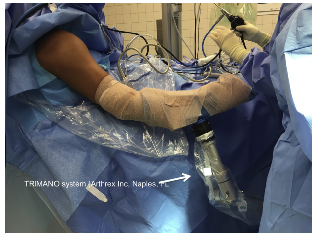
Fig 5. Intraoperative photograph demonstrating operative arm (right arm) of a patient placed in the beach chair position using the Trimano commercial arm holder (Arthrex).

padded face-mask; tape placed over the eyes by the anesthesia team will also protect against corneal abrasions. Sequential compression devices are placed on both lower extremities for venous thromboembolism prophylaxis (Fig 1). After induction of anesthesia, and prior to positioning, an examination under anesthesia (EUA) should be carried out on the operative shoulder, assessing range of motion and stability in all directions.