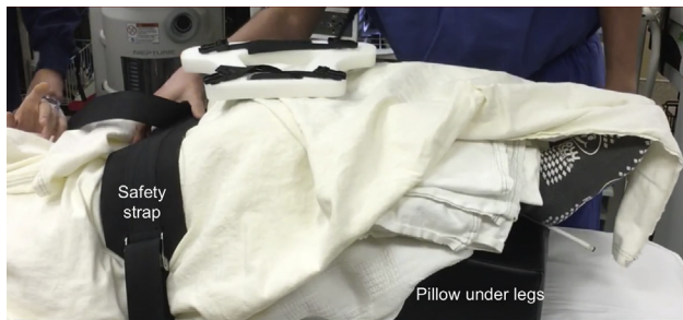
Fig 7. Intraoperative photograph demonstrating the use of a safety strap across a patient placed in the beach chair position for shoulder arthroscopy.

of the bed; this will ensure the lumbar spine is in a favorable position during the procedure (Fig 2). At this point, the back of the bed is lifted to approximately 60° and the patient is shifted so the medial border of their scapula is just at the edge of the bed. Several folded surgical towels can be placed medial to the patient's scapula to improve the shoulder position. The patient's buttocks should be confirmed as being firmly against the operating table with no gap between the patient and the operating table. A large pad or several pillows can be placed underneath the patient's legs. The nonoperative arm can be tucked and secured to the patient's abdomen or placed on an arm board. Care should be taken to confirm that all bony prominences, particularly on the nonsurgical arm, are well padded.