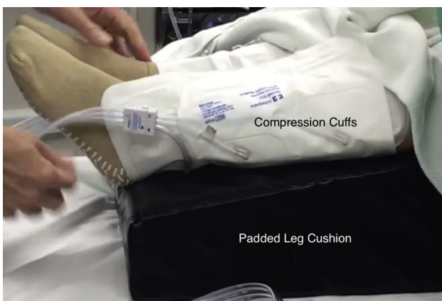
Fig 1. Intraoperative photograph demonstrating the use of sequential compression devices for venous thromboembolism prophylaxis during shoulder arthroscopy in the beach chair position.

general anesthesia for the surgery and allows for an easy transition to the supine position should airway complications arise. 1,2 In the subsequent section, we describe our technique for BC patient positioning for shoulder arthroscopy. A summary of key steps is provided in Table 1 , and a summary of the technique is provided in Video 1 .