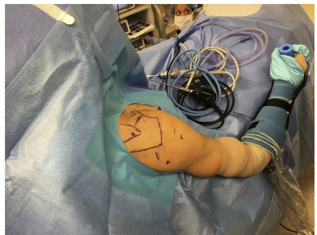
Fig 8. Operative arm (right arm) of a patient placed in the beach chair position (Spider Limb Positioner; Smith & Nephew) with anticipated portal sites marked using bony landmarks, including the acromion, clavicle, acromioclavicular joint, and coracoid process. (A, anterior; L, lateral; P, posterior.)

In this Technical Note, we describe a safe, reliable, and reproducible technique for patient positioning in the BC position for shoulder arthroscopy. Shoulder arthroscopy can be performed in either the LD or BC position, with advantages and disadvantages to each