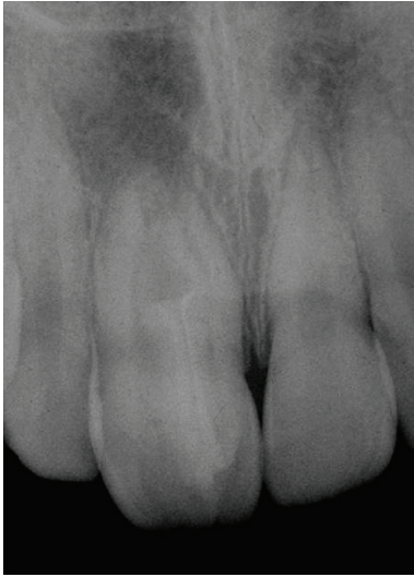
FIGURE 1: Diagnostic radiograph. Note the presence of type III dens invaginatus and a radiolucent image at the apex of tooth no. 11.

endodontic treatment has been tried with success by several professionals [2, 21, 22].