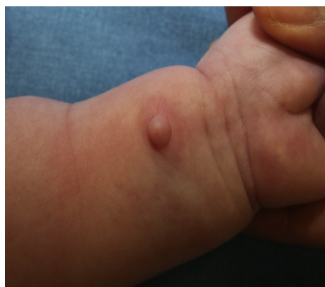
Fig 1. A firm solitary nodule protruding from the volar side of the patient's left wrist.

13 to 25 pale-staining, concentric lamellae. The inner core and surrounding lamellae were immunopositive for S-100 protein, and the outer perineurial cells stained positive for epithelial membrane antigen. Neurofilament protein reactivity in the inner core showed the presence of axons. The lesion showed no interval changes during the 13-month follow-up period.