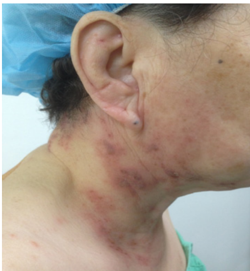
Fig. 1. Sixteen days after the onset of herpes zoster. Hyperpigmented macules and crusts are present on the right C2-4 dermatomes.

imaginable). Additionally, she complained of severe itching in the affected areas.