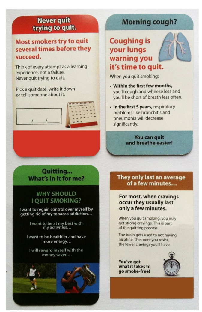
Figure 2 Pack inserts highlighting the benefits of quitting or providing tips on how to do so.

Prior to the questions on inserts, participants were shown an image of a cigarette pack with an insert shown in the front of the pack—as they typically appear in packs—alongside the text 'We have some questions on pack inserts, which can sometimes be found inside packs (see image for example)'. For each question about inserts, participants were shown the question and an image of one insert. Four different inserts were used in total, as shown in figure 2, with these chosen from the eight used in Canada as they were considered most relevant to our sample. The words 'Health Canada' were removed from the bottom of