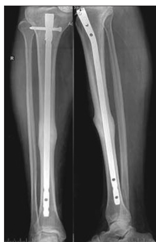
Figure 3: X-rays anteroposterior and lateral views of a case of closed isolated tibial shaft fracture. 18 months after distal dynamization and bone marrow injection showing solid union