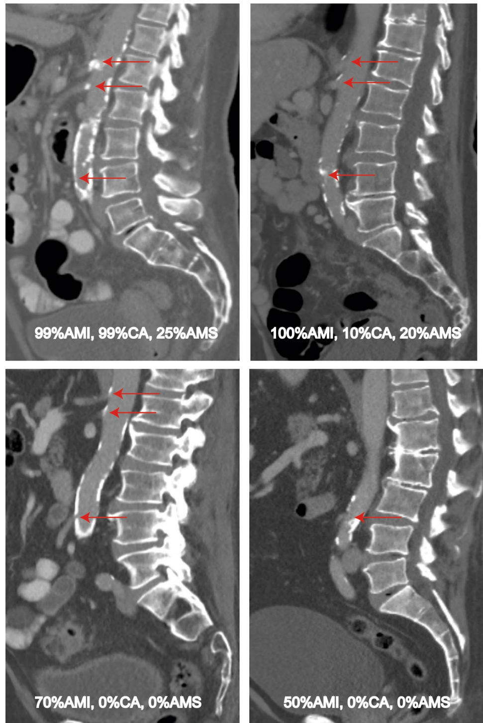
Fig. 2 Abdominal CT-images of patients with mesenteric occlusive disease

(82%). Twelve patients (16%) were treated with radiological intervention and one patient (1%) received conservative treatment (i.e. intravenous antibiotics). Of patients treated with surgical reintervention, 55 patients (89%) received a stoma; 33 patients (60%) were treated with an end colostomy and 22 patients (40%) with a deviating stoma. Most of the AL patients who received a stoma either at primary resection