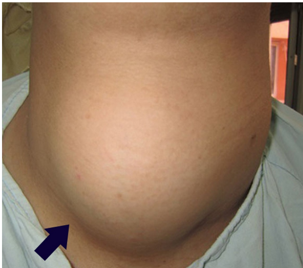
FIGURE 1: Anterior view

sized nodules or masses reaching superiorly to the level of the floor of the mouth and having a large posterior mediastinal extension into the right hemithorax behind the trachea and the right main bronchus (Figure 1-2). There was a marked attenuation of the laryngeal and tracheal air column with a mild shift to the right side. A noticeable displacement of the posterior mediastinum and carotid sheath vessels was noted with no gross vascular invasion.