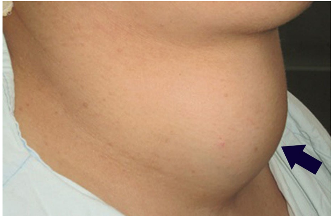
FIGURE 2: Lateral view

An ultrasound of the neck revealed that both thyroid lobes and the isthmus were enlarged; all showed multiple variable-sized heterogeneous nodules. The nodules measured about 7x5.5 cm and some nodules showed areas of cystic degeneration. The right lobe = 11x8x7 cm in dimension, the left lobe = 10x7x7 cm in dimension, and the isthmus was 6 cm in anterior-posterior diameter. The patient was admitted to the Shebin Elkom Teaching Hospital and surgery was done by a team of general surgeons, cardiothoracic surgeons, and ear, nose, and throat (ENT) surgeons. A decision was taken to make both cervical and posterolateral thoracotomy incisions to prevent the risk of any future illnesses or death resulting from acute airway obstruction; the patient consented and was prepared for the operation. We performed the operation using the transcervical and right poster-thoracotomy approach. First, we made a collar (Kocher's) incision on the neck (Figure 3).