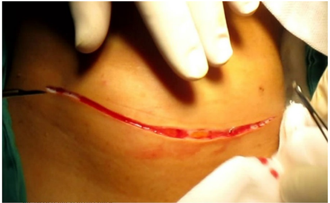
FIGURE 3: Cervical incision

We excised the left lobe of the thyroid gland and the isthmus. Then, we excised the cervical part of the right lobe. The superior and inferior thyroid arteries and veins were ligated. During the operation, we had some problems with separating the lower thyroid artery because of the huge mass of the thyroid gland. The separation of the lower thyroid artery was difficult because of the absence of enough space between the right lobe of the thyroid gland and the sternum due to continuity into the mediastinum (Figure 4). Consequently, we slightly elevated the sternum. This allowed the ligation of the inferior thyroid artery. The patient was converted to the left lateral position and a right posterolateral thoracotomy through the bed of the right fourth intercostal space was made. The posterior mediastinum was inspected; it was a large mass extending from the root of the neck down to the azygos arch encroaching on the superior vena cava, the trachea, the right main bronchus medially, and the esophagus and the posterior chest wall posteriorly. It was a pedicle mass reaching up to the right subclavian artery. The dissection was made very cautiously so as not to injure any of the surrounding structures and the mass was extracted (Figure 5).