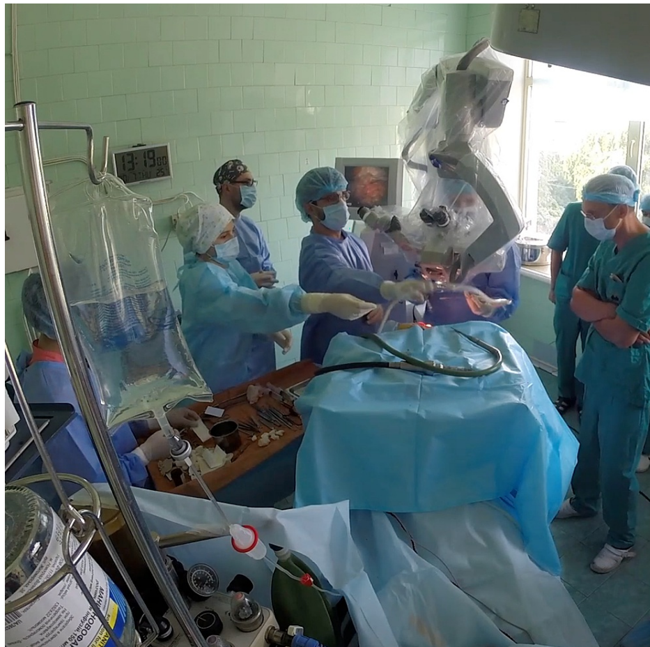
FIGURE 1: Operating room setup in a resource-limited setting for surgical clip ligation of ACOM aneurysm (Kyiv, Ukraine).

Incision, Pterional Craniotomy, and Opening of Dura: A standard frontotemporal incision is marked extending from the root of the zygoma directly in front of the tragus of the ear toward the hairline in the midline of the head. In this case, a single musculo-fasciocutaneous flap was raised and reflected anterior-inferiorly. Craniotomy is performed using pneumatic Midas Rex drills (Medtronic, Minneapolis, MN, USA). The dura is flapped anteriorly along with the fasciocutaneous flap (Figure 2A).