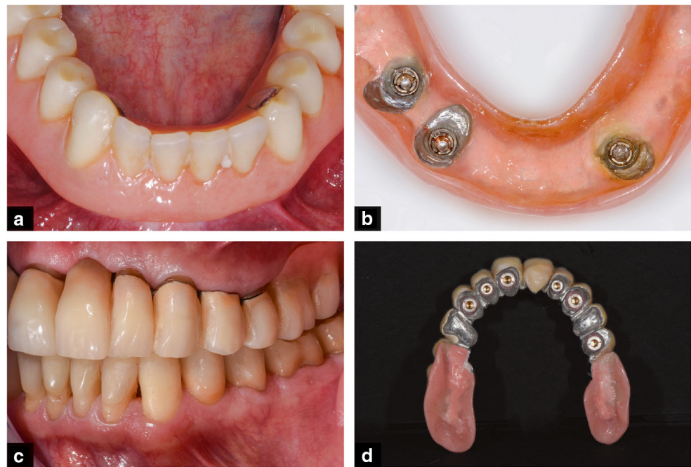
Fig. 1 a, b Intra- and extraoral view of an ROD with a closed denture design (complete coverage of the abutment teeth). c, d Intra- and extraoral view of an ROD with an open denture design (finishing line on the abutment teeth)

Technical complications included decementation of the gold coping, coping or post-fractures, loss of retention, loss of the denture matrix and denture base or denture teeth fractures.