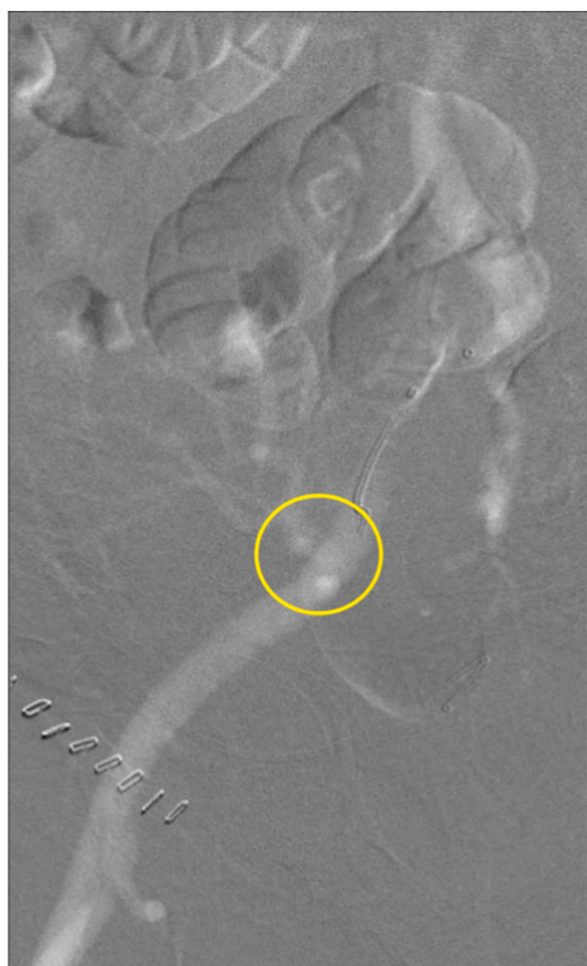
Fig. 1. Renal CO 2 angiogram. Renal artery stenosis likely due to kinking is observed.