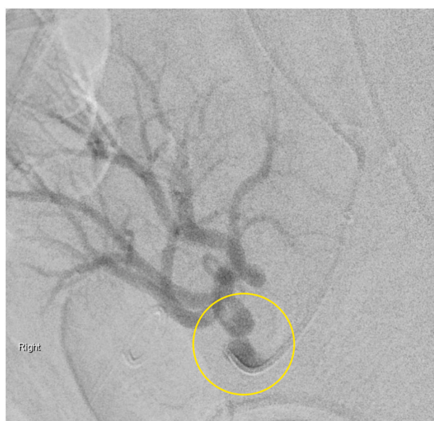
Fig. 4. Post-balloon angioplast renal angiogram. Renal angiogram shows continued stenosis secondary to renal artery kinking after attempted angioplasty.

complication is not currently well defined. Several management techniques have been successfully utilized including conservative management [5], endovascular repair [8,10], or surgical correction [7,9,11,12]. In cases where the renal artery kink is near the anastomosis and there is evidence of early graft dysfunction (rising creatinine, decreased urine output, or uncontrolled hypertension), the renal artery kinks are often resistant to endovascular repair and require prompt surgical correction with nephropexy or re-anastomosis [3,7,9,10,11,12]. It is likely the kink does not act as a true stenosis and frequently rebounds to its former configuration after percutaneous transluminal angioplasty or is propagated distally during stenting [3]. With malposition of the graft the most likely cause of kinking, it can be deduced that surgical re-anastomosis or repositioning of the graft is often required to permanently correct the dysfunction. Based on literature review, only 15% (2/13) of TRAS