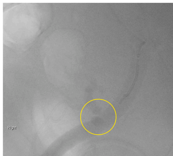
Fig. 2. Renal angiogram with limited iodine contrast. Renal angiogram with contrast shows evidence of stenosis due to kinking.

Early recognition and correction of this complication is paramount to preventing graft loss and morbidity, but management of this