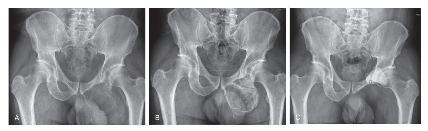
Figure 1. A. A well-defined 11 \times 9 \times 8 cm expansile osteolytic lesion extending from the left ischium to the lower arm of the left pubis in a 52-yearold man with progressive pain in his left hip and leg. Radiographic findings were consistent with the diagnosis of GCTB. B. 3 months after the start of denosumab treatment, there was no progression of disease and increased radiopacity of the lesion. C. 5 years after resection of the ischium and inferior ramus of the pubis followed by phenolization and cementation of the posterior acetabular wall, there was no evidence of recurrent disease.

of denosumab, the patient reported less pain. Radiographs showed remarkably increased radiopacity of the lesion (Figure 1B). MRI showed that there was no progression of disease, and areas of central liquefaction were noticed (Figure 2B). 7 months after the start of denosumab treatment, arterial embolization to prevent excessive intraoperative hemorrhage was followed by intralesional resection with phenolization and PMMA cementation of the osteotomy planes of os ischium, inferior ramus of os pubis, and acetabulum. The soft tissue extension observed previously showed an ossified rim, which facilitated surgical approach. No reconstruction was needed and no complications were reported (Figure 1C). Denosumab was continued for 6 months postoperatively. Histology of the surgical specimen showed GCTB with reactive stromal cells and scattered spindle cells with elongated oval-shaped nuclei without evident atypia. Diffusely clustered foamy macrophages were also seen. No multinucleated giant cells were seen, in contrast to previous biopsies, indicating a good response to denosumab (Figures 3C, 3D). Follow-up included physical examination and imaging on a regular basis. 5 years postoperatively, there were no signs of local recurrence or pulmonary metastases. Apart from occasional muscular cramps in the gluteal area, the patient does not suffer from any complaints and physical functioning is not impaired.