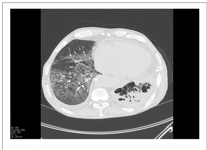
FIGURE 2 | Chest CT-scan showing the presence of extensive pulmonary infarction in the residual parenchyma.

So, the patient underwent to a lower left lobectomy surgery and a typical lingulectomy in anterolateral thoracotomy. Given the increase in inflammation indices and the progressive increase in opacity of the residual left lung parenchyma due to infarction ( Figure 2 ), the patient was submitted to a left pneumonectomy. The hospital stay lasted 10 days and the patient was discharged in good clinical conditions. The final histopathological diagnosis was a 7,5-cm lung Adenocarcinoma; the bronchial surgical margin was negative and visceral pleural invasion was not observed. Of the 12 dissected lymph nodes, all were reported as negative and the pathological stage was reported as IIIA (T4N0M0).