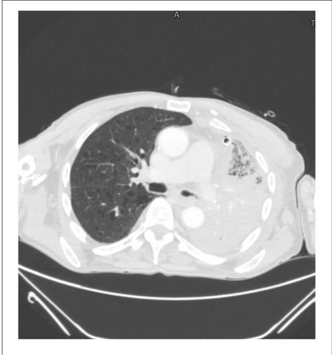
FIGURE 5 | An almost complete recovery revealed by a new chest CT scan.

Various studies worldwide stated that hospitalized, ill coronavirus disease 2019 (COVID-19) patients are frequently developing laboratory abnormalities compatible with a state of hypercoagulability and clinically a high prevalence of thromboembolic events (5). Ranucci et al. (1) recently reported a coagulation analyses including d-dimers, fibrinogen levels, in the COVID-19 patients, and reported the procoagulant profile on ICU admission with median d-dimer levels 10 times the upper limit of normal (5.5 mg/L).