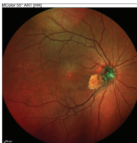
Figure 1: Retinography image, fundus of the eye showing juxtapapillary tumor lesion

Shields et al. 5 found astrocytic hamartomas in combination with macular edema, intraretinal edema, and retinal traction on the surface of the tumor in 20%, 27%, and 27% of cases, respectively. No studies have observed an association with the presence of epiretinal membrane or metamorphopsia as observed in our case. Some authors have reported spontaneous resolution of the macular edema in retinal astrocytic hamartomas associated with tuberous sclerosis. 3,9 In our patient, however, the condition was unlikely to resolve