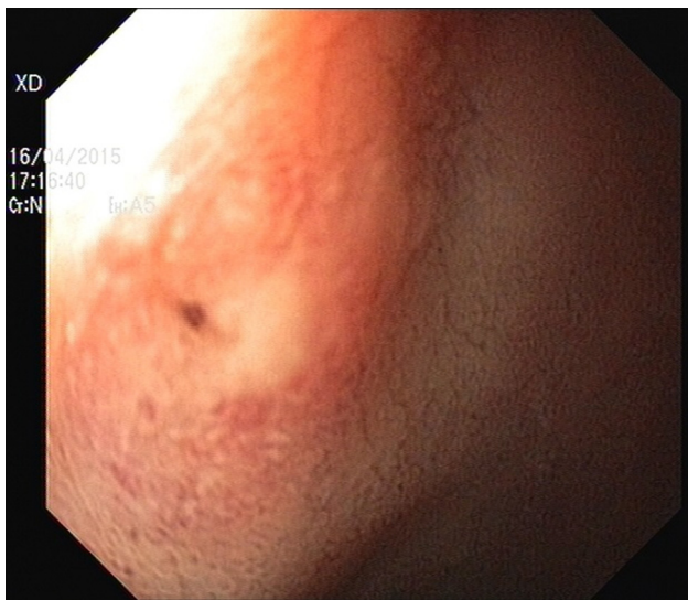
Figure 2 Fistulous opening in the antero-superior duodenal bulb wall.

the literature. The possible mechanism of the liver abscess secondary to fish bone migration from the duodenum it's the creation of a duodenohepatic fistula covered by duodenal serosa. 2 Since the first reported case, treatments usually