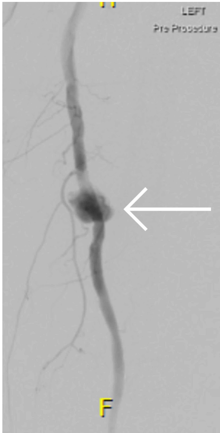
FIGURE 1: Angiogram demonstrating the left SFA PSA pre-