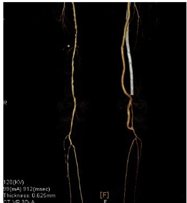
Fig 2. Three-dimensional computed tomography reconstruction from images acquired at the 5-year follow-up. Computed tomography data obtained at the 5-year follow-up revealed patency of the polytetrafluoroethylene graft, vein cuff anastomosis, and every branch of the left lower limb.

Intimal hyperplasia in the suture line is thought to be the primary cause of restenosis or thromboembolism after vascular anastomosis. 6 Shear stress due to end-to-side anastomosis between two vessels that exhibit a size discrepancy is one potential mechanism. 7 Another mechanism of intimal hyperplasia is compliance mismatch in