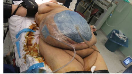
FIGURE 2: Two NPTs are seen.

gauze was used around EAF and pezzet drain tube to support segmentation of ostomy side from OA wound. Two NPT systems were applied; one was standard abdominal NPT (Figure 2), and the second one was performed on the ileostomy opening where the EAF was directed with pezzet tube. Synchronized negative pressure was applied to both NPTs [10]. The second NPT on ostomy place was changed 3-4 times a day.