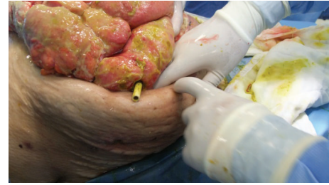
FIGURE 1: Pezzet drain is seen in EAF.

At postoperative 9th day, after EAF development, she was consulted and transferred to our clinic. Her general condition, consciousness, and orientation were not well. She was mechanically ventilated. Her vital parameters, intra-abdominal pressure (IAP), SOFA score, and estimated mortality rate were shown in Table 1. She was in septic shock and mild metabolic acidosis (Table 2). She underwent emergent reoperation. There was very wide OA wound (70 * 60 cm in diameter) with high output enteric fistula and severe visceral adhesion. All intestine was very edematous and fragile and according to new modified Björck classification OA score of the patient was 2c score [9]. All the intra-abdominal content was irrigated with saline. Perforation point of ileum was seen at the previous anastomosis side (Figure 1). A pezzet drain was inserted in the EAF and redirected to the place where ileostomy was planned to open. Glycerin-impregnated