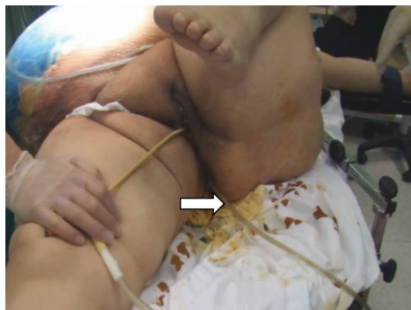
FIGURE 4: Intrarectal NPT was shown by arrow.

to be the most important risk factors [12]. In our case, she was elderly, morbid, obese patient with DM and CLD. She had complicated recurrent giant hernia, although she underwent operation for IH 6 times. Duration of strangulation is the most important determinant of the outcome regarding gut viability, resection-anastomosis rate, morbidity, and mortality [13]. Andrews noted a mortality rate of 1.4%, 10% and 21% when strangulated hernia presented within 24 hours, 24–48 hours, and after 48 hours, respectively [14]. In our case duration of strangulation was more than 96 hours and there was severe peritonitis with necrosis and perforation of small bowel at the first operation.