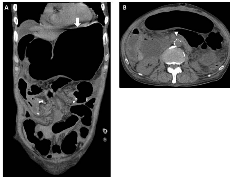
FIGURE 1: Findings of the CT scan performed on the seventh postoperative day

(A) Coronal CT findings showed that the stomach (white arrow) was highly dilated, but no obstruction was observed in the pelvic small intestine and colon. (B) Axial CT findings showed that the aorta-mesenteric distance (white arrowhead) was 4.4 mm.