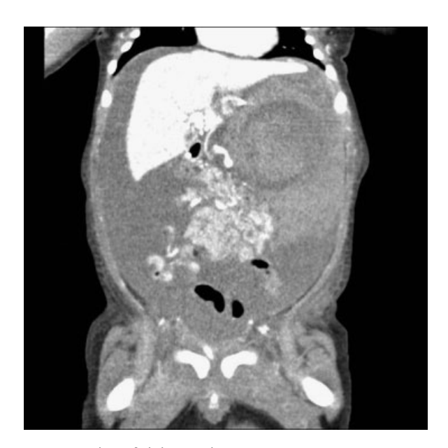
Fig. 1 Coronal CT of abdomen showing massive pneumoperitoneum.

Intra-abdominal bleeding in the newborn is uncommon. The presentation can be variable and can occur as a consequence