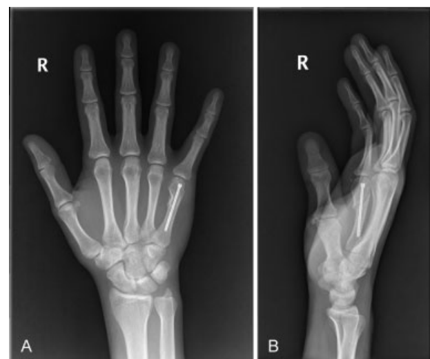
Fig. 2 (A and B) Postoperative X-rays of one of our cases treated with an intramedullary cannulated screw.