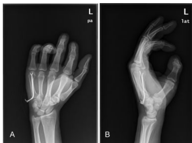
Fig. 1 (A and B) Postoperative X-rays of one of our cases treated with antegrade Kirschner wire pinning.

The data were analyzed with a Mann-Whitney U test, using the SPSS statistical software (IBM, NY).