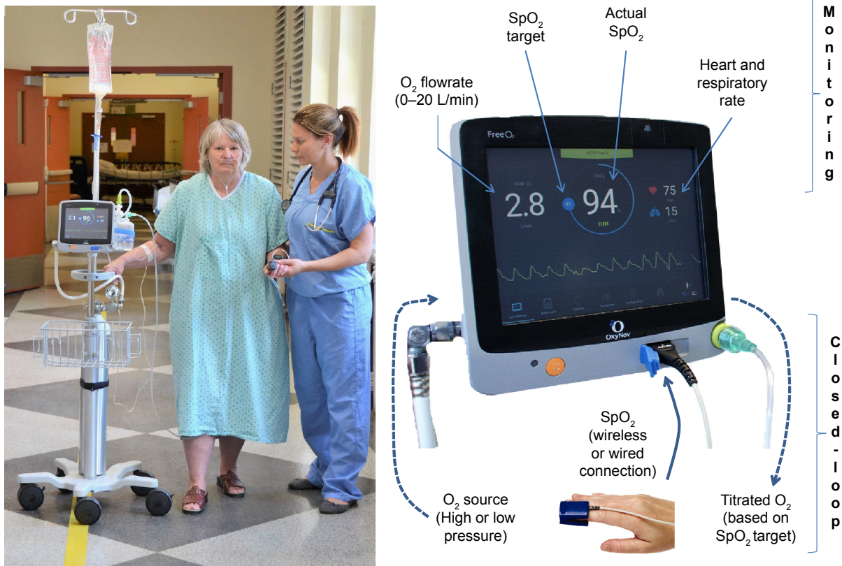
Figure 1 Main features of the FreeO 2 : oxygen automated titration and weaning with SpO 2 -O 2 flow closed-loop and monitoring.

Notes: The FreeO 2 adjusts the oxygen flow rate from 0 L/min to 20 L/min (flow accuracy \pm 0.1 L/min) every second, based on the patient's needs. A proportional integral controller adjusts the oxygen flow based on the difference between the SpO 2 target set by clinicians and the continuously measured SpO 2 . Several cardiorespiratory parameters are continuously recorded (O 2 flow rate, SpO 2 , respiratory rate, and heart rate), and trends for these parameters are available for clinicians. Both heart rate and respiratory rate are derived from the pulse oximeter plethysmographic wave form. The version used in the study was a previous version of the device with similar technical features.