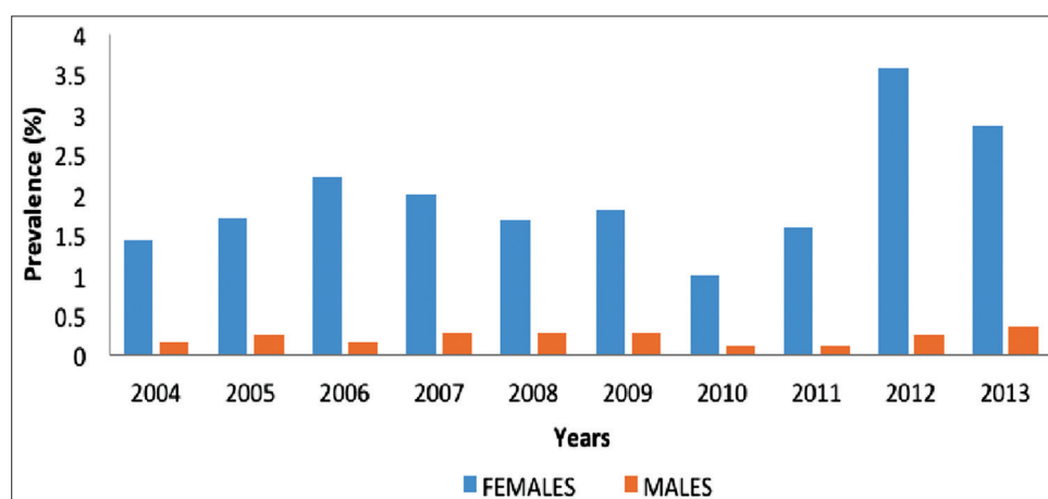
Figure-2: Sex-wise temporal pattern of bovine tuberculosis among slaughtered cattle at Bauchi municipal abattoir (2004-2013).

*Statistically significant ( p < 0.001 ), CI=Confidence interval, bTB=Bovine tuberculosis