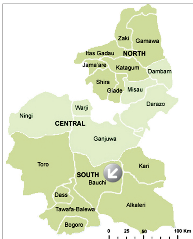
Figure-1: Map of Bauchi State with arrow indicating Bauchi Local Government Area (sourced from Google maps, Accessed on March 26, 2018).

A total of 108,638 representing 56.07 \times 10^3 males and 52.57 \times 10^3 female cattle were slaughtered in Bauchi municipal abattoir from 2004 to 2013. Of these, 1230 had suspected gross bTB lesions