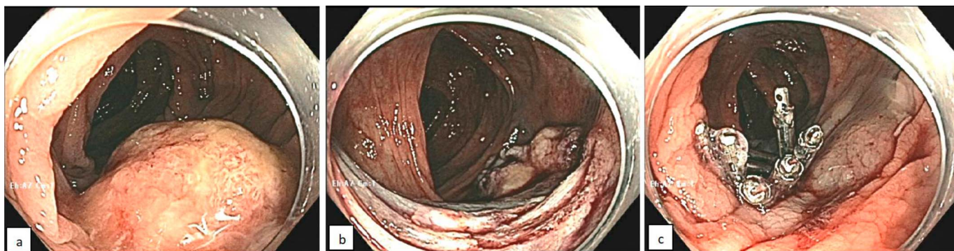
Figure 1. Colonoscopy showing (A) transverse colon polyp before resection, (B) the site after resection and snare tip soft coagulation of the edges, and (C) clips deployed at the resection site.

echocardiogram after antibiotics showed resolution of the vegetations. Six months later, repeat colonoscopy after prophylactic amoxicillin revealed clip artifact on the EMR site but no evidence of residual polyp or cancer by inspection or biopsy.