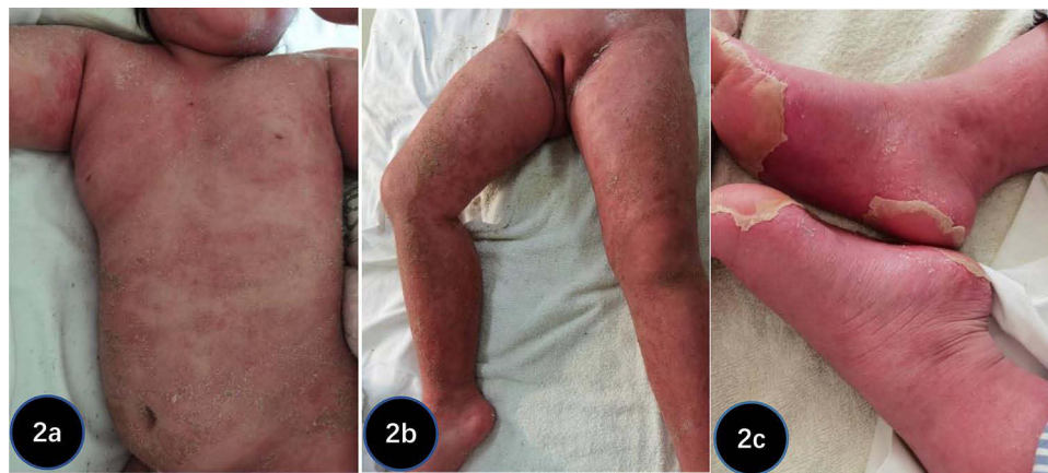
Figure 2 (a–c) Skin flushing in the forehead due to EP on April 25 gradually spread to the entire body, accompanied by dry yellow scabs and an absence of obvious pustules.