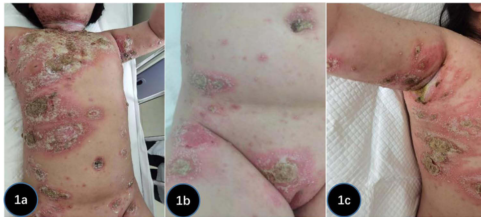
Figure 1 (a–c) Upon admission on April 7, the patient's whole body was covered with dense pustules, local congestion was evident, dandruff and dry scabs were scattered, and some abscesses coalesced into the blemish.

to the whole body, accompanied by slight itching. The local hospital diagnosed her with “generalized pustular psoriasis (GPP)”. In the four days leading up to admission, she was having a fever. After her admission, we conducted a series of examinations and carried out treatments according to her diagnosis. Detailed clinical data are reported below.