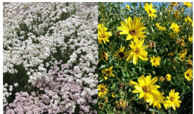
FIGURE 1 Photographs of Eriogonum fasciculatum (left) and Encelia californica (right), two of the shrub species seeded at the West Loma Ecological Restoration Experiment. Eriogonum was more abundant on S-facing slopes and increased in cover during the drought, while Encelia was more abundant on N-facing slopes and its cover increased very little during drought years

The cover of all species changed significantly through time (Appendix S3). The majority of species (55%) had significantly higher cover on one slope aspect than another. For example, the shrub Eriogonum fasciculatum and the forb Salvia columbariae had higher cover on S-facing slopes than N-facing slopes, while the shrub Encelia californica , the forb Phacelia cicutaria , and the perennial bunchgrass Stipa pulchra had higher cover on N-facing slopes (Figures 1 and 2). Significant slope aspect-by-year