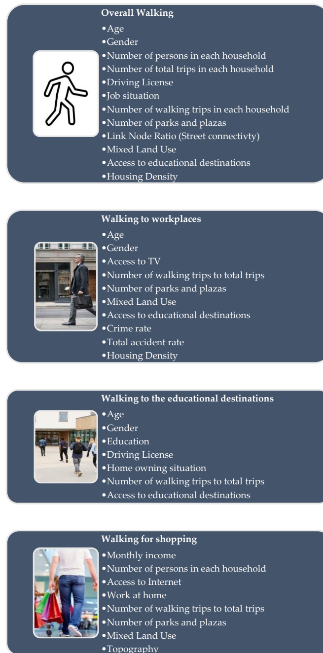
Figure 2. The summary of the correlated factors to overall walking and the three types of walking, including walking to workplaces, walking to reach the educational destinations, and walking for shopping (Pictures taken from https://www.vecteezy.com ; https://www.drweil.com ; https://www.thecompleteuniversityguide.co.uk ; https://www.justlovewalking.com/ . All the mentioned websites were accessed on 30 April 2022).

Figure 2 depicts a summary of the socio-demographic, societal, and built-environmental elements that influence overall walking, as well as the three categories of walking: walking to work, walking to educational destinations, and walking for shopping.