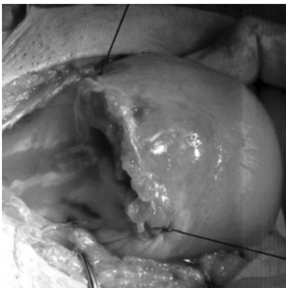
Fig. 3 Uterine rupture with complete opening of the uterine wall at the site of the previous transverse scar.

uterine incision. The frequency of uterine rupture is approximately 1% with previous low-segment transverse cesarean section during labor and approximately 4 to 9% with a vertical or T-shaped section. 1 The subsequent pregnancy outcome after conservative management of uterine rupture has only been studied in several small case series, among which the prevalence of recurrence is in a wide range of approximately 0 to 33%. 2,3