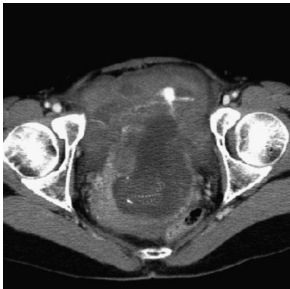
Fig. 2 Dynamic computed tomography revealing discontinuity of the uterine muscle layer in the lower uterine segment.

Over the 3 hours following admission, her symptoms gradually worsened and her hemoglobin level decreased to 7.9 g/dL; however, her vital signs remained stable. An addi-