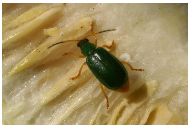
Figure 1. Diabroticite beetle of the species Diabrotica dissimilis Jacoby feeding on the seeds of an open fruit from wild, bitter Cucurbita okeechobeensis ssp. martinezii (L.H. Bailey). This plant species of the family Cucurbitaceae is native to Veracruz, Mexico.

Moreover, the diversification of Diabrotica spp. cannot be interpreted without taking into account its intricate relationship with wild species of the family Cucurbitaceae [2,5]. This plant family is characterized by the production of bitter, toxic secondary compounds—the cucurbitacins that render the plants unpalatable for most herbivores, including humans [35,52,53]. To date over 40 cucurbitacins and cucurbitacin-metabolites are known from Cucurbitaceae, and many of them have important medicinal properties [54]. The tetracyclic triterpenoids are typically found in wild species of cucurbits [55] and act as compulsive feeding arrestants for Diabrotica species [56,57]. When Diabroticite beetles encounter plant tissues with cucurbitacins they are arrested and continue to feed compulsively on the bitter tissues (Figure 1) [58–62].