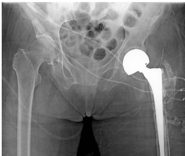
Fig. 5. Immediate postrevision operative plain radiograph.