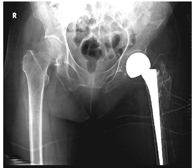
Fig. 3. Immediate postoperative plain radiograph.

At the sixth week of the postoperative period, the patient felt clicking in her left hip while walking and was unable to move her