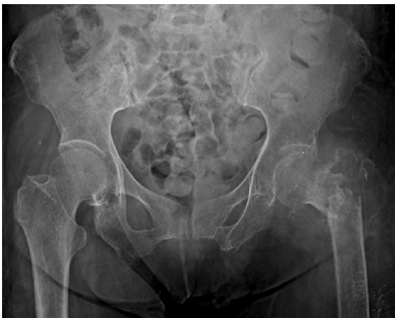
Fig. 2. Initial plain radiograph of fracture.

for hip dislocation following total hip replacement due to her poor muscle condition. An operation for long-stem cemented bipolar hemiarthroplasty was done (CPT, Zimmer, Inc., Warsaw, IN, USA). The operation was done by the posterior approach. After the stem was placed in the femoral canal, the femoral head component was coupled with one stroke of a hammer after the stem neck was cleaned and dried. After insertion of the femoral head, the surgeon inspected the coupling again by trying to pull the head out of the stem neck gently by finger to confirm a perfect coupling.