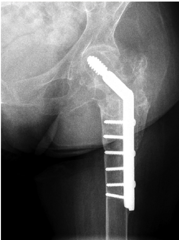
Fig. 1. Plain radiograph shows failure of dynamic hip screw fixation.