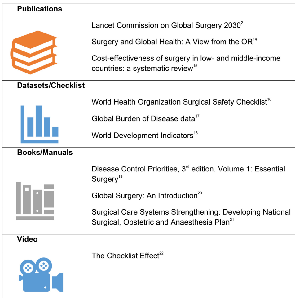
FIGURE 1. Top 10 Resources in Global Surgery

Surgery and Global Health: A View from Beyond the OR (2008) is widely regarded as the impetus