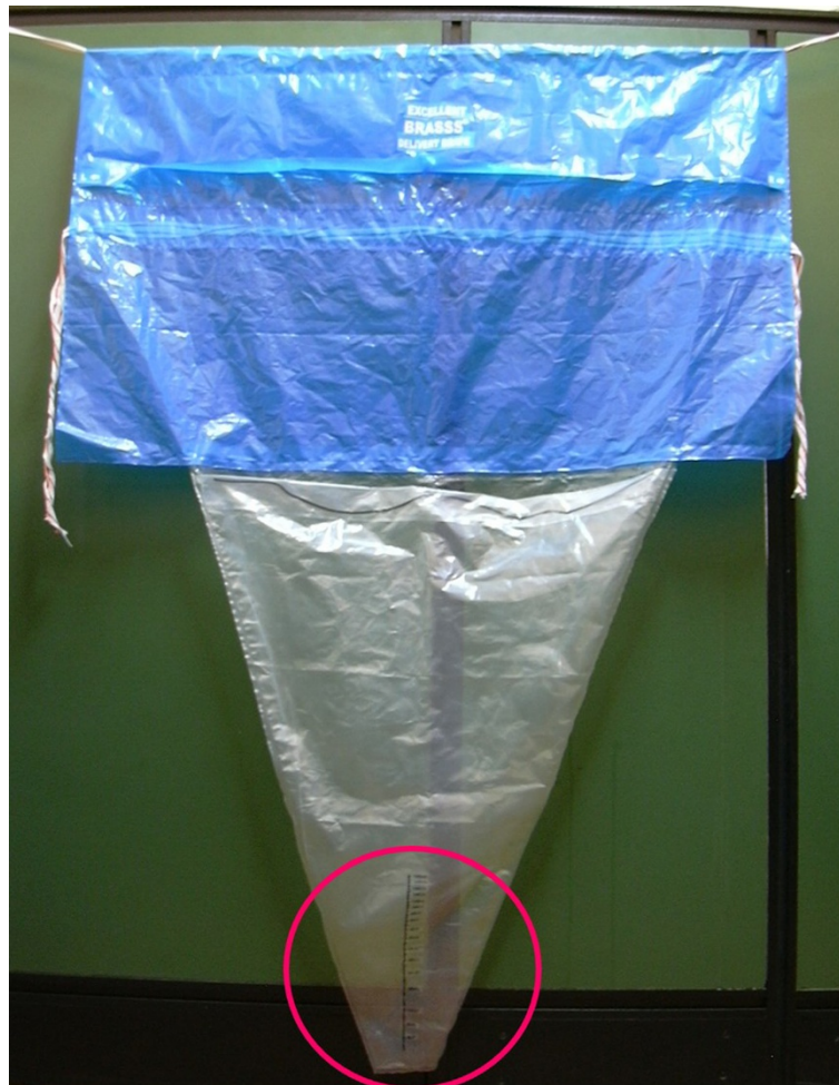
Figure 1 Photo of the Excellent BRASSS-V Drape™, a blood collection drape with a calibrated collection pouch.

All women aged 18 and older presenting at the study site (KEM Hospital in Pune, India) for an imminent vaginal delivery were considered eligible and were invited to join the study. Women who agreed to participate were randomized to one of the two measurement methods. Cards indicating group allocation were placed in opaque sequentially numbered envelopes, randomized in blocks of 10 via a computerized randomization sequence generated in New York by Gynuity Health Projects staff. Envelopes were opened by study staff after enrollment. All participants received the standard care provided during the third stage of labor at the study hospital. Provider actions related to the prevention or treatment of PPH (including blood loss interpretation) were as per provider preference and standard hospital practice and not dictated by the study protocol. Standard active management at KEM Hospital is 10 units oxytocin IM or IV immediately after the birth of the shoulder of the baby. Any participant who was referred for a cesarean section was withdrawn from the study post-randomization; the