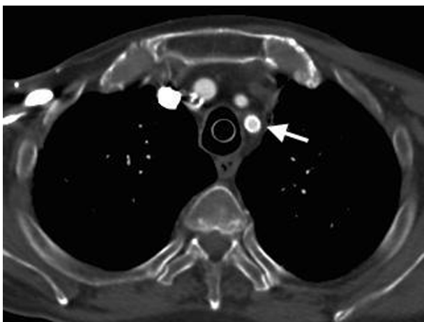
Figure 4 Follow-up computed tomographic angiography at 3 years. Note: Arrow indicates covered stent.

Radiation injury to supra-aortic vessels is a rare and late complication of radiotherapy in the treatment for head and neck or breast cancer. Lesions may be stenotic or aneurysmal. The pathophysiology includes occlusion of the vasa vasorum leading to vascular fibrosis, intimal thickening, and endothelial damage, which can accelerate atherosclerosis and pseudo aneurysm formation. 3 The classical procedure for subclavian artery aneurysm or occlusive lesions is open surgery. The first treatment of subclavian aneurysm was common carotid and innominate artery ligation, performed by Wright Post in 1817 and then by Valentine Mott a year later. 4 Since then, with the advent of modern surgery, the cervical approach with possible extension to a sternotomy is usually performed. There are not