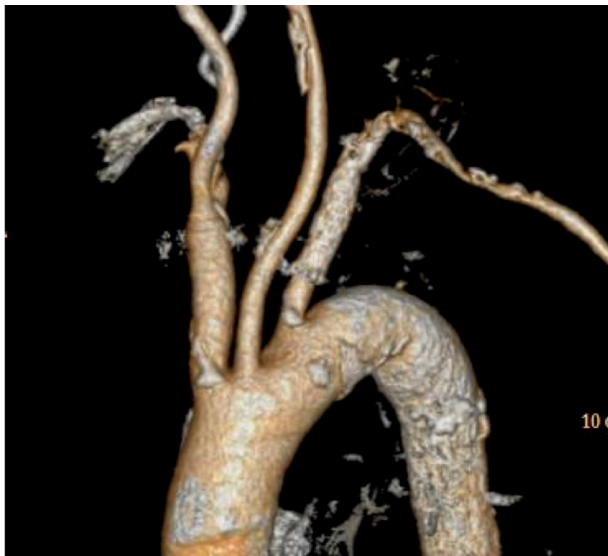
Figure 3 Three-dimensional reconstruction after surgery.