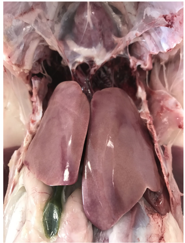
Figure 3. Unremarkable liver of a flock affected by hepatic lipidosis (NA group).