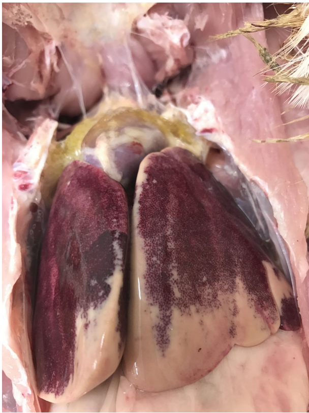
Figure 2. Liver with hepatic lipidosis (HL group).

Contents of the hydroxylated analog of methionine: CD 1: 1.18 g/kg DM; CD 2: 1.19 g/kg DM; CD 3: <0.20 g/kg DM; DRG:1.79 g/kg DM.