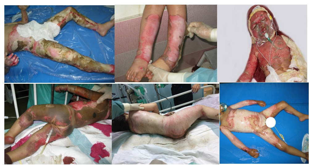
Fig. 1. A total of 115 isolates were studied during current survey in 2016 (The Medical Ethic Committee permitted us for releasing pictures)

Antimicrobial susceptibility of colistin against A. baumannii isolates was investigated by the minimum inhibitory concentration (MIC) method. Colistin sulfate (Sigma-Aldrich, St. Louis, MO, USA) was tested over a range of dilutions (64-0.5µg/ml). For this purpose, 100 µl colistin sulfate (diluted in water) 128 mg/ ml were added to 96-well U bottom microplates. In the following 10µl of bacterial suspension containing 1.5 \times 10^5 , CFU/ml of cells was added to wells with serially different concentrations of colistin. In the end, the microplate was incubated in ambient air at 37 °C for 24 h. The breakpoints of The Clinical and Laboratory Standards Institute (CLSI) were applied as references (12).