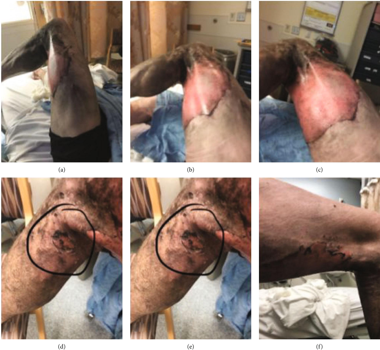
FIGURE 1: Images (a–f) are the presenting burn injuries on the left lower extremity.

viable and had been incorporated fully; however, there was some evidence of graft hypertrophy and signs of contracture around the boundary of the graft.