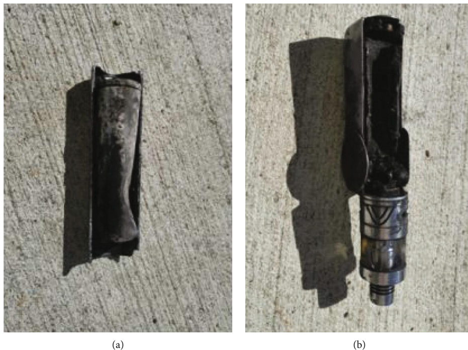
FIGURE 2: Images (a, b) represent the electronic cigarette after it exploded.