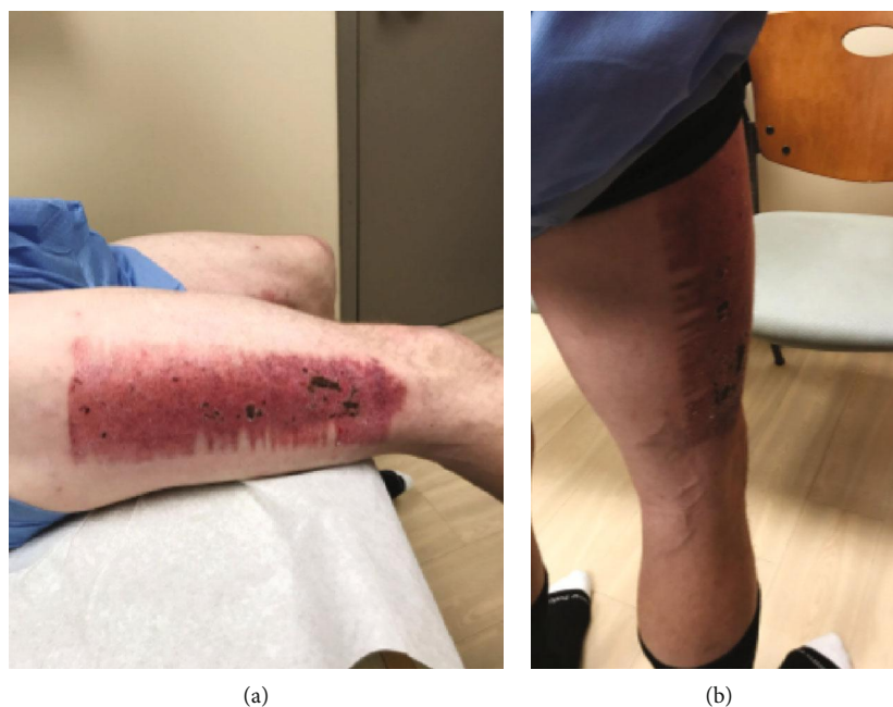
FIGURE 3: The right thigh site of the split thickness skin graft donor site. The patient is one month after grafting.

15-110 degrees on the left and 5-130 degrees on the right (Table 1). The patient had bilateral hip extension to neutral.