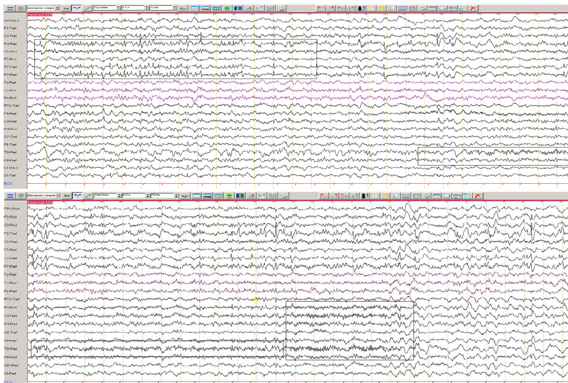
Fig. 2. EEG recording during an ictal psychosis Patient with visual hallucinations and heteroaggressive behaviour. EEG record during the episode shows (A) interictal epileptiform activity over T7, P7, P3 (box) and (B) subclinical seizures (42 subclinical seizures in 6 hours) starting with alpha rhythm in T8 and spreading to the right frontotemporal area (box).

We aimed to study the neuro-modulatory effect of VNS on psychotic episodes in drug-resistant epilepsy (DRE) patients with a pre-existing history of PPE in a single-center retrospective analysis.