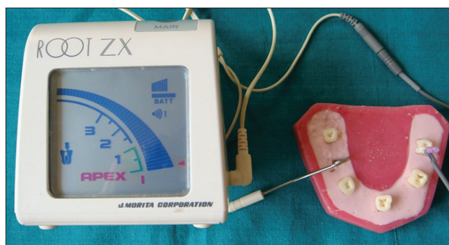
Figure 4: Experimental setup showing Root ZX apex locator connected to teeth

The data was statistically analyzed using