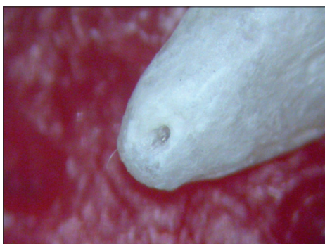
Figure 3: File tip flush with apical foramen (viewed under operating microscope)