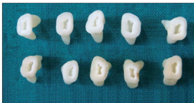
Figure 1: Decoronated maxillary teeth