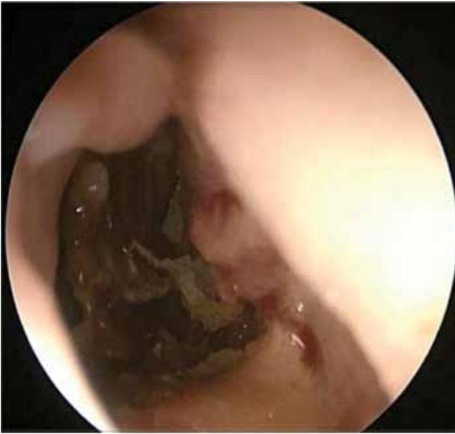
Figure 1. Partial perforation in septal cartilage.