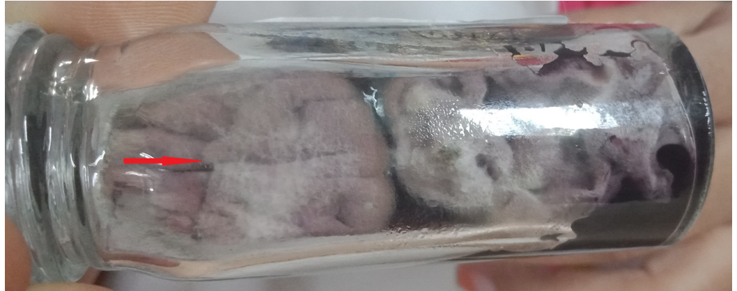
FIGURE 3: Culture specimen on day 14.

which was further confirmed on day 14 (Figure 3).