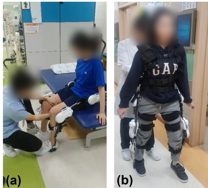
Figure 1. Robotic exoskeleton-assisted overground gait training. (a) Standing training wearing ANGELLEGS; (b) gait training wearing ANGELLEGS.