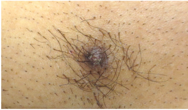
Fig. 1. Solitary, hyperkeratotic, hyperpigmented nodule on the mons pubis

report describes a WD that arose in the context of an infundibular cyst on the left aspect of the vulva of a 53-year-old patient (Torres and Junkins-Hopkins 2016).