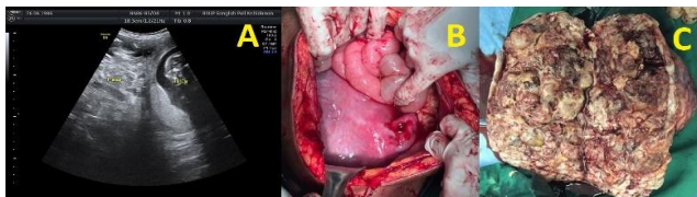
Figure 1: Ultrasonography and Macroscopy of Immature Teratoma Durante Operation. A. Left adnexal mass hypohyperechoic with size that cannot reach by the probe at 19 weeks 5 day GA; B. Uterus size corresponding with 18-20 weeks GA, left Fallopian tube normal, post-oophorectomy; C. Lobulated solid mass with multiseptate cystic inside it.

Thirty-one-year-old female, G2P1A0, 8 weeks 1 day GA, with solid ovarian tumour 15 x 15 x 15 cm in size. At 19 weeks 5-day GA, the tumour size became 30 x 30 x 30 cm, solid, rough surface, mobile, and painful. Tumour marker was raising, AFP 699.9 IU/mL and LDH 579 U/L. The patient had conservative primary surgery (left oophorectomy, omentectomy, and ascites fluid cytology). Midline incision performed, Durante operation evaluation with minimal uterus manipulation and seen solid mass 40 x 40 x 40 cm in size, rough surface, left ovary origin, omental attach then adhesiolysis done, rupture, and successfully removed. Internal abdominal organ evaluation: uterus corresponding 18-20 weeks GA, right and left Fallopian tube, right ovary, peritoneum, omentum, and liver normal. Histopathological concluded grade II immature teratoma of the left ovary with the neuroepithelial and fat immature component.