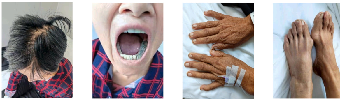
Fig. 4. Follow-up at 1 year, the hair and nails have grown again and skin pigmentation has been relieved.

the serum protein electrophoresis was mildly changed. From the physical examination, we found that the patient had alopecia, onychatrophy, rampant caries, weight loss and skin pigmentation. The diagnosis of Cronkhite Canada syndrome (CCS) was established because of these physical characteristics and a related inspection. Because there is no uniform standard for the diagnosis of CCS the patient was treated with protecting the mucosal barrier and regulating the intestinal flora of disbalance, and his diarrhea improved within a short period of time. The patient accepted the treatment of supplementing trace elements because of deficiency and the patient also accepted the treatment of eradicating Helicobacter pylori because of infection. We suggested that the patient take glucocorticoids to have a relief, but she refused considering the side effects of glucocorticoids. The patient was followed up irregularly within 1 year and had not totally adhered to the advice provided by chief physician, but after 1 year she still had a hospitalization, we found the symptoms of the diarrhea are relieved, the weight of the patient is increased, and the hair and nails of the patient have grown again (see Figs. 3 and 4).