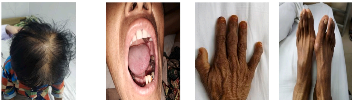
Fig. 3. From the physical examination we found that the patient had alopecia, onychatrophy, rampant caries and skin pigmentation.

specimen showed a macroscopic appearance of grayish white tissue involving the gastric antrum and gastric body. Microscopically, polype hyperplasia was observed. Fig. 2A was a photograph of the tissue involving the ileocecal junction. Histopathological examination of the specimen showed a macroscopic appearance of grayish white tissue involving the ileocecal junction. Microscopically, acute and chronic mucosal inflammation and the expansion of the glands and crypt abscess were found. It is rare for the multiple polyps we considered the patient maybe have an immune system disease, so the patient had a tests of autoimmunity, and the index of the immunity system was normal and