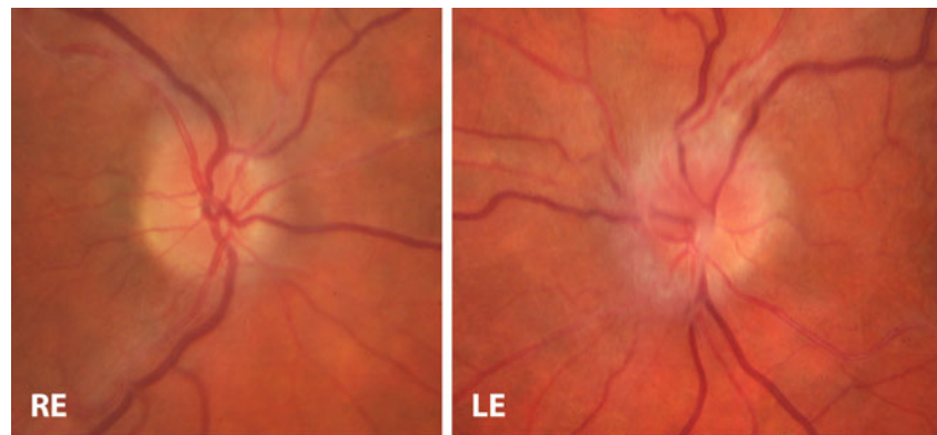
Fig. 1 Colour fundus photograph of both eyes. Left eye shows optic disc swelling and epiretinal membrane. Right eye shows healthy optic nerve

meningitis, fungal meningitis, prion disease and neurosarcoidosis. He was still afebrile and initial blood investigations and infection screen (including VDRL, HIV and AFB) were all normal.