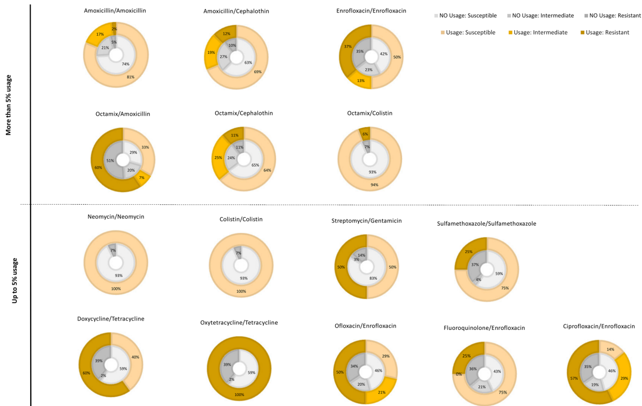
Figure 1. Resistance patterns (susceptible, intermediate, resistant) for antimicrobials that were used or not used on 172 integrated chicken-fish farms in Myanmar. Antimicrobials were separated in two groups, representing frequent application (> 5%) and infrequent application (<= 5%) across all integrated chicken-fish farms.

In our study we did not test for carbapenems, however, we had no isolates resistant to ceftiofur, and only four isolates resistant to ceftiofur, three of which were MDR and MDR was identified in 42.4% of isolates.