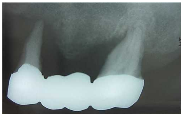
Figure 1 Dental X-ray of the patient's maxillary left region.

A few days later, the swelling spread to the left buccal region and spontaneous pain became more intense, leading to more difficulty while eating for 2–3 days. On September 28, the primary care physician instructed the patient to visit our hospital. At 2:30 p.m. that day, upon examination at our general dental department, the Glasgow Coma Scale score was 11. The patient was immediately referred to the dental anesthesiology department, and the physical findings included facial pallor, cold hands and fingers, and shivering. Palpation