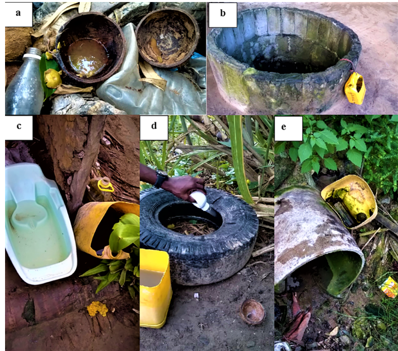
Fig 2. Different water containers serving as breeding sites for Aedes aegypti mosquitoes around the patients' households. a) Coconut shell; b) unclosed well; c) basin and buckets; d) tire; e) sewer pipe.

https://doi.org/10.1371/journal.pone.0192110.g002