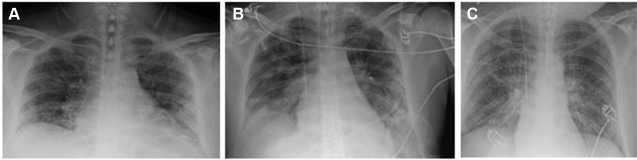
Figure 1 – Chest radiograph of the study patient at admission (A) and following respiratory decline (B and C).

The patient remained stable but did not improve on ECMO for 5 days. On day 11 of hospitalization, he was administered five ampules of 6 mL surfactant (calfactant; 35 mg/mL phospholipid suspension), determined based on 20 mg phospholipids/kg of lean body weight, similar to dosing in a prior adult surfactant treatment trial that showed clinical improvement. 5 The surfactant was administered via tracheobronchial suction catheter passed through the endotracheal tube with the distal suction tip positioned above the carina, and then dispersed directly into the lungs. The patient was sequentially turned right side down and then left side down immediately subsequent to administration. Prior to administration, oxygen saturation was 89% on F_{IO_2} 100%, PaO_2/F_{IO_2} was 148, and compliance was measured at 31 mL/cm H_2O . Subsequently, PaO_2/F_{IO_2} improved to 185 after 18 h and to 231 after 36 h (Fig 2), at which point the patient was weaned from ECMO. The patient was extubated the following day and was discharged 8 days later.